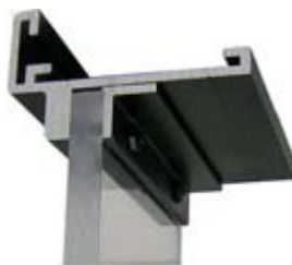
with pins Frame screen hanging screen to minimize deflection/bow