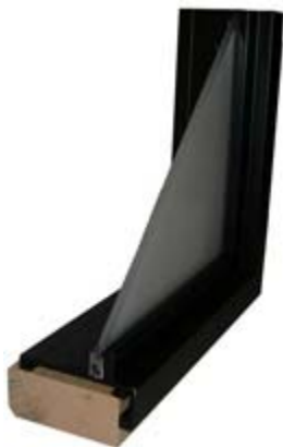
rp Frame 3 Self Finishing J Frame Click for brochure