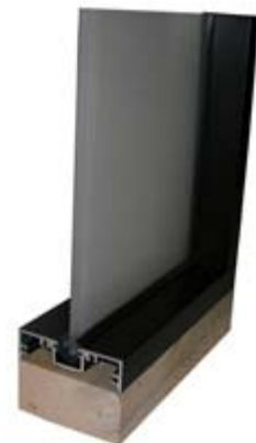
rp Frame 4 (Heavy Weight) Frame New lower profile design