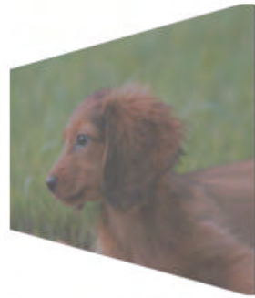
Traditional screen at angle