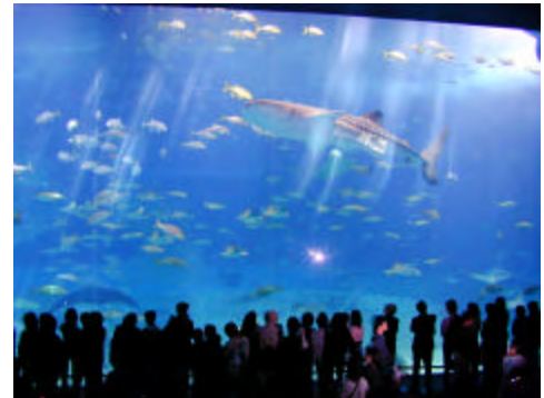
Not a projection, actual photo of Okinawa Aquarium Tank through Nippura Aqua-wall®

Nippura is known for its core business of creating the world's largest acrylic panels, tunnels, cylinders and spheres for the professional aquarium industry. Nippura was the first company ever in 1968 to produce a large scale aquarium from acrylic (PMMA). Nippura has been the catalyst for the modernization of theme park aquariums. While Nippura Aquarium products can be found all over the world you may find yourself staring through them at some of the more local notable aquariums like the Monterey Bay Aquarium, Atlantis Paradise Island, Baltimore Aquarium, New York Aquarium, Ripley's Aquarium Gatlinburg, & the new Georgia Aquarium just to mention a few... The largest size Aquarium Window Aqua-wall® created to date by Nippura measures more 74' x 27' x 2' thick (297,000lbs) and listed in the 2004 Guinness Book of Records. Nippura's technology for consistently producing hi-tolerance cell cast acrylic in large sizes with exacting optical properties has been leveraged for developing Blue Ocean® Rear Projection Screens.