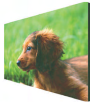
BLUE OCEAN screen at angle A brilliant, uniform, and extremely wide viewing cone.